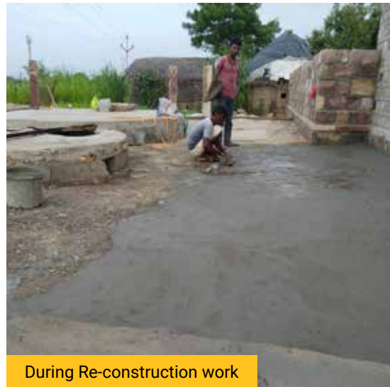
During Re-construction work

With the re-construction of the catchment area of the sump tank, he will now save Rs. 4,000/- spent on buying the water. During the monsoon this year, the tanka got filled and now it has 12 ft of water, instead of 3ft water, which was the case before the re-construction. Now, he has secured safe water for drinking and domestic use for approximately 7 to 8 months, as compared to previous times. RAF Global also increased the catchment area considerably. The storage capacity of the tank has therefore increased.