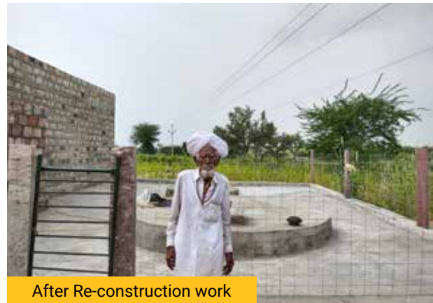
After Re-construction work