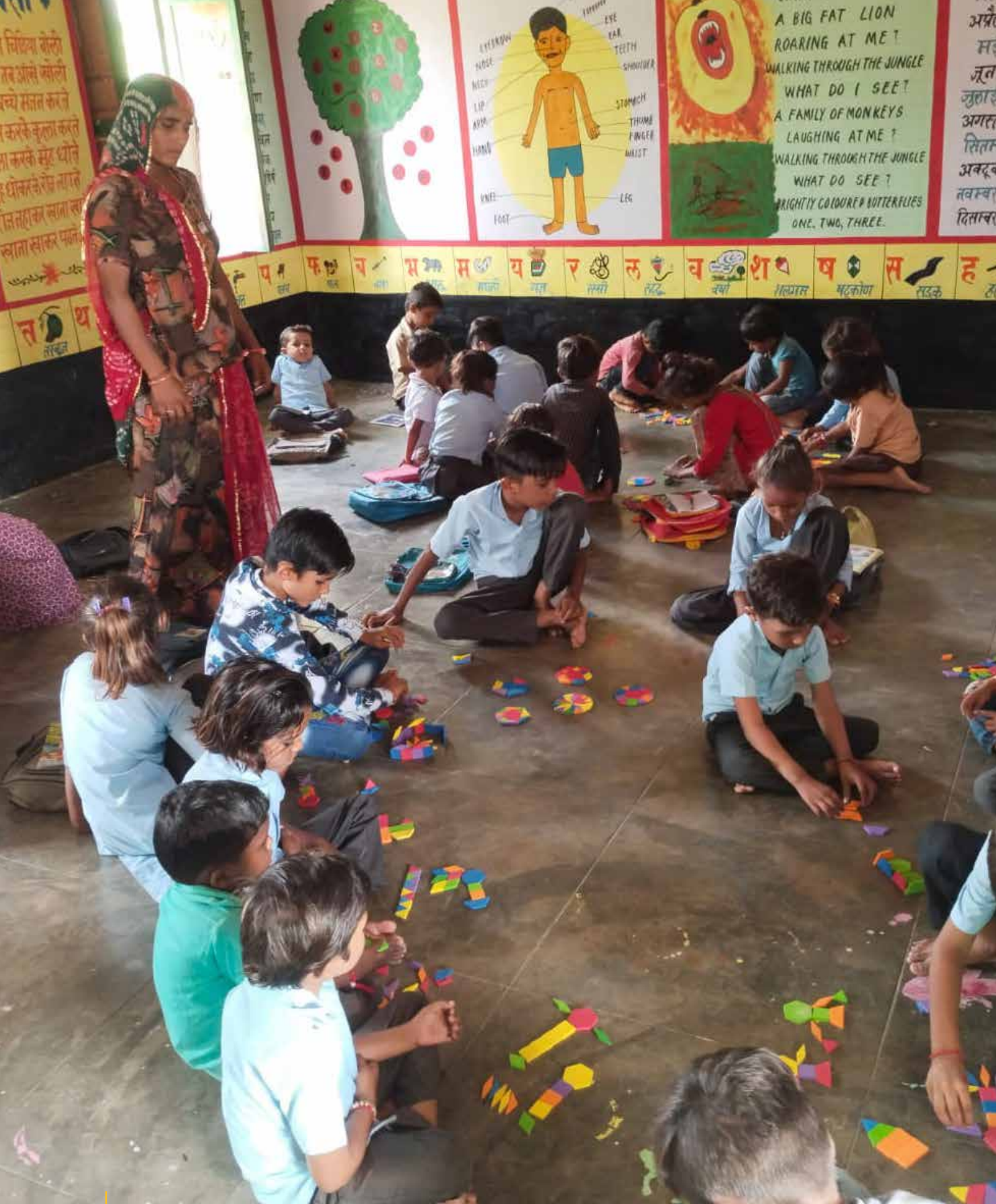
Bal Mela at Anganwadi Centre, Barmer