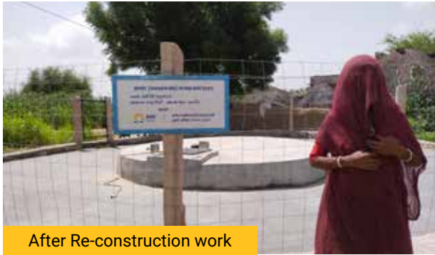
After Re-construction work

With the re-construction of the catchment area of the sump tank, she will now save Rs. 5000/- spent on buying the water. During the monsoon this year, the tanka got filled and now it has 10 ft of water i.e., 25,000, instead of 3ft water, which was the case before the re-construction. Now she would be able to get water for 7-8 months, as compared to 2 months before the re-construction.