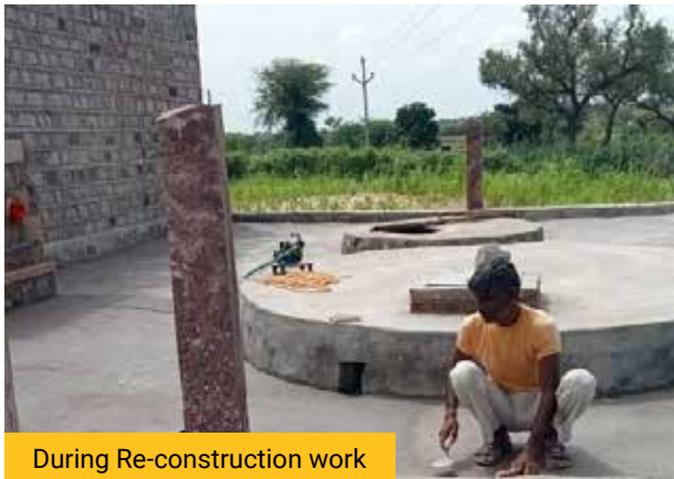
During Re-construction work