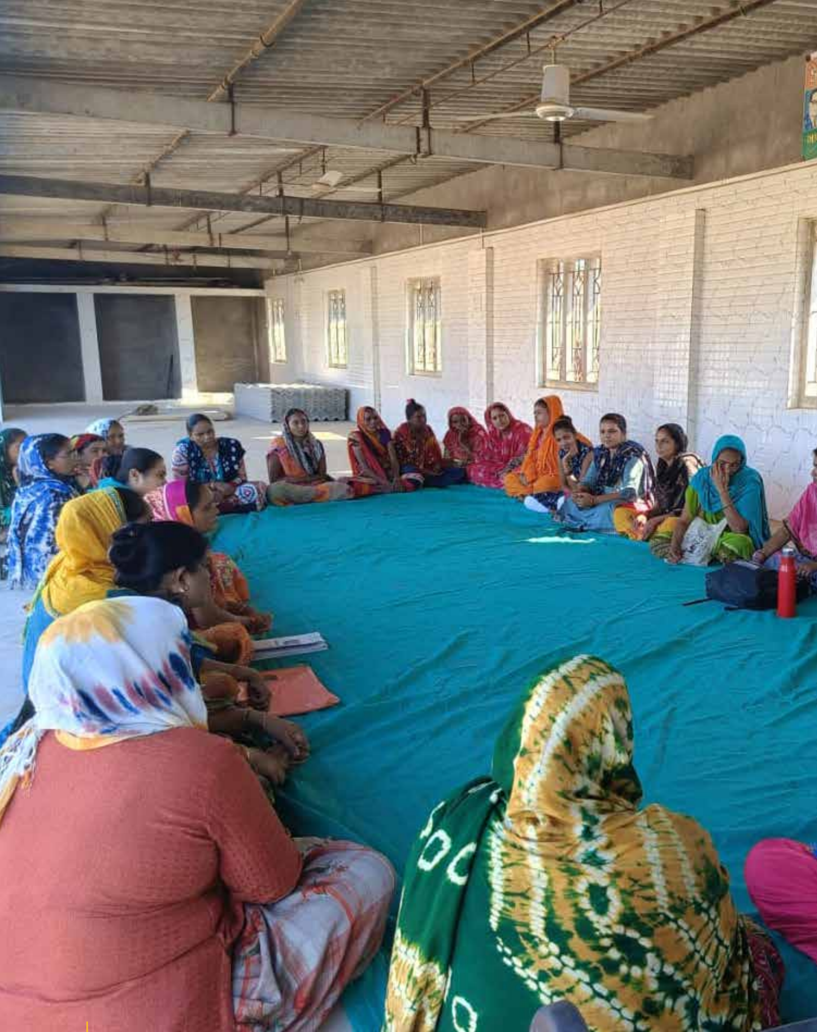
Meeting of Village Volunteers in Gujarat