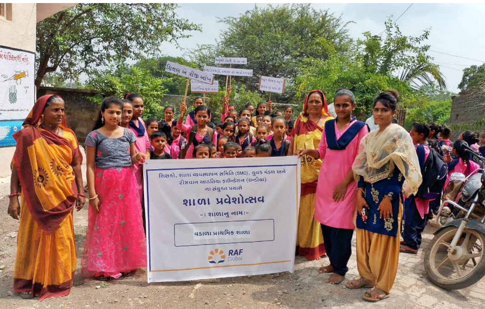
School Enrolment Drive in Porbandar, Gujarat

During the reporting period, RAF Global in India has strengthened its programmes in the Western and the Eastern regions of the country with regular monitoring, strategic partnerships with panchayats, technical agencies, Government institutions and institutional donors. The credibility of RAF Global has been established across all stakeholders. The period was marked with several recruitments in area offices, orientation on programme to the new team members, and regular sessions on perspective building for the entire team besides, extending handholding support to them at regular intervals, towards smooth implementation of the programme activities. Covering the six thematic areas spread across sustainable livelihood for women and youth, agriculture, health and nutrition, education, good governance and humanitarian response, RAF Global has worked in 107 villages, 7 blocks, 5 districts and 3 states , in the Financial Year 2022-23.