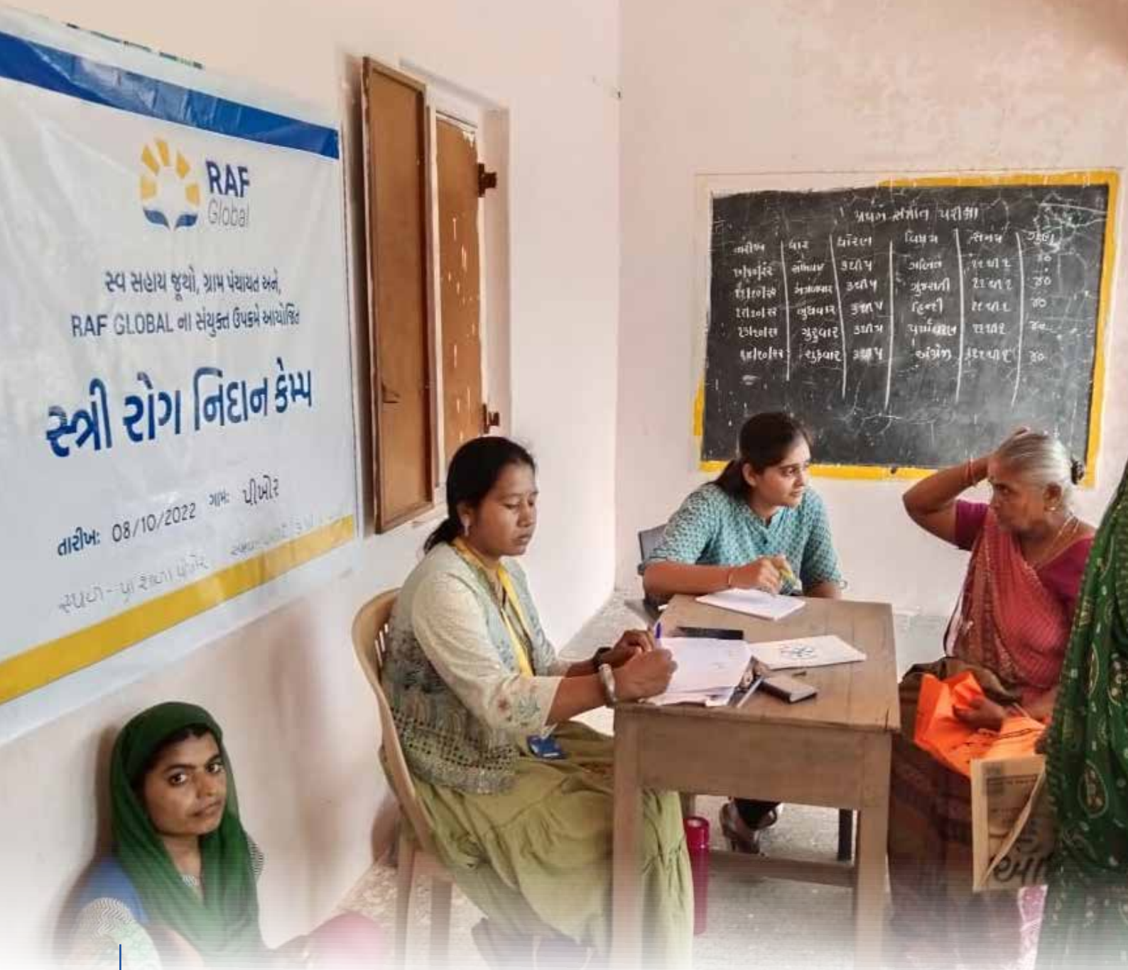
A female health camp in Gujarat, organised in collaboration with SHGs and Gram Panchayat