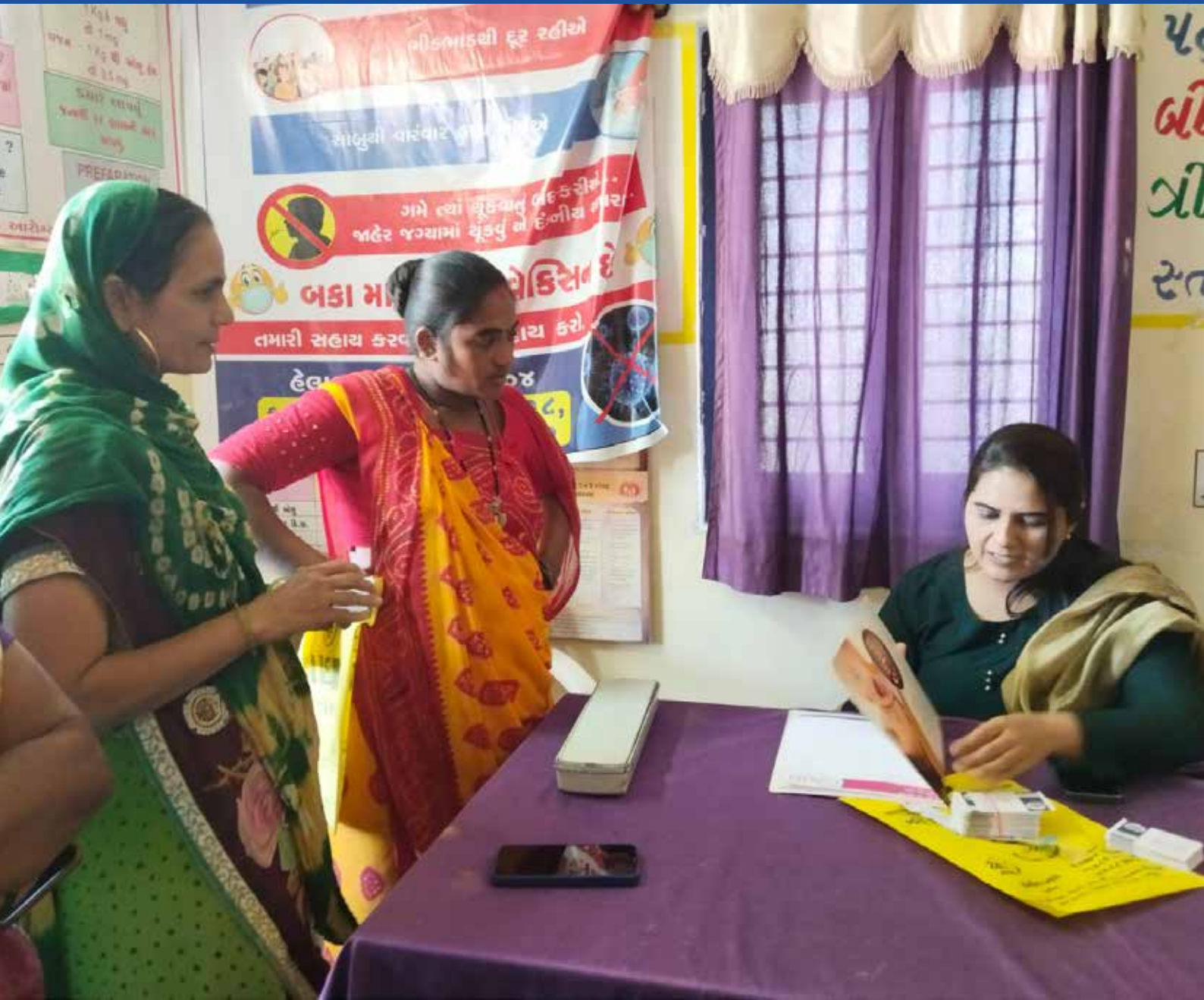
A Gynaecology camp in Porbandar