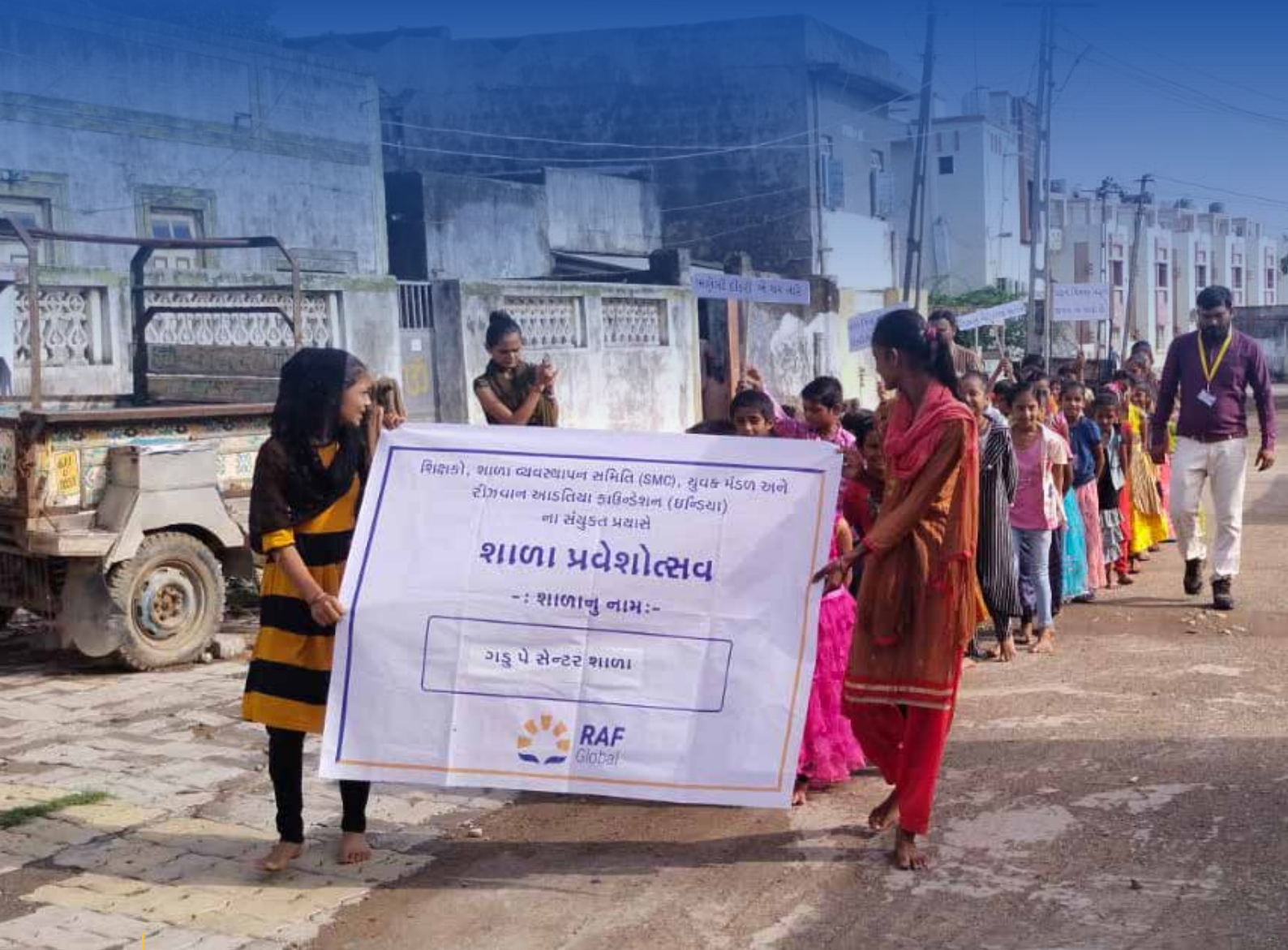
School Enrolment Drive in Gujarat

RAF Global is a private, non-denominational, not-for-profit international organisation committed to improving the quality of life primarily in selected countries across Africa and Asia. RAF Global has branches and affiliates in 6 countries. RAF Global works with the most marginalised individuals, families, communities in the poorest areas of Asia and Africa to improve the Quality of Life by acting as a catalyst that brings together resources, technology, systems, and effective grassroots strategies, giving better choices and control to people for a lasting change. In pursuit of its mission, RAF Global endeavours to make long-term, strategic and systemic investment in the areas of Economic Integration and Livelihood Support for Women and Youth, Climate Smart Agriculture, Health and Nutrition Initiatives, Education and Technology, Good Governance and Humanitarian Response.