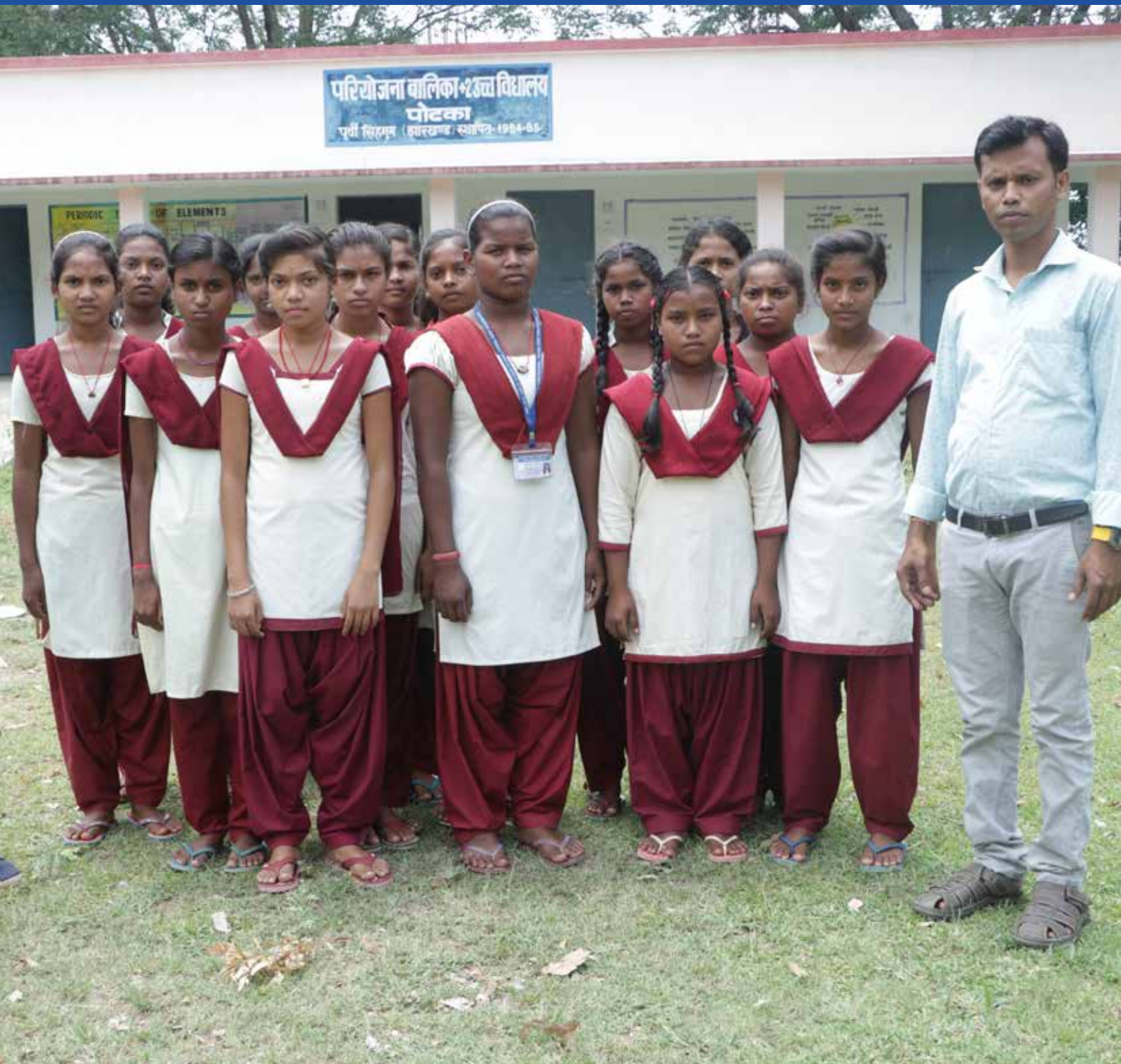
School students of Manpur high School, Jharkhand with a team member of RAF Global in India