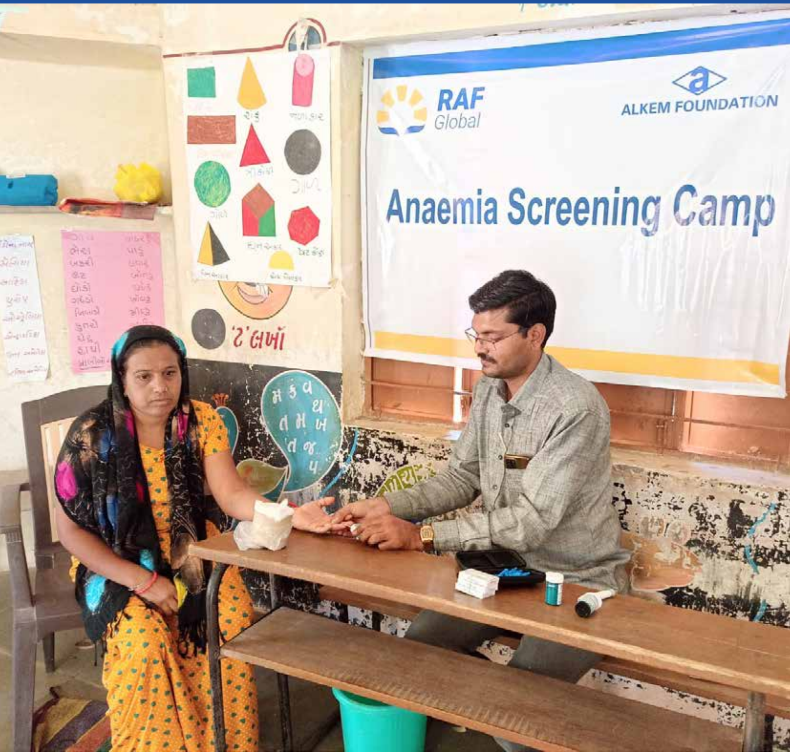
Anaemia Screening Camp, in Gujarat.