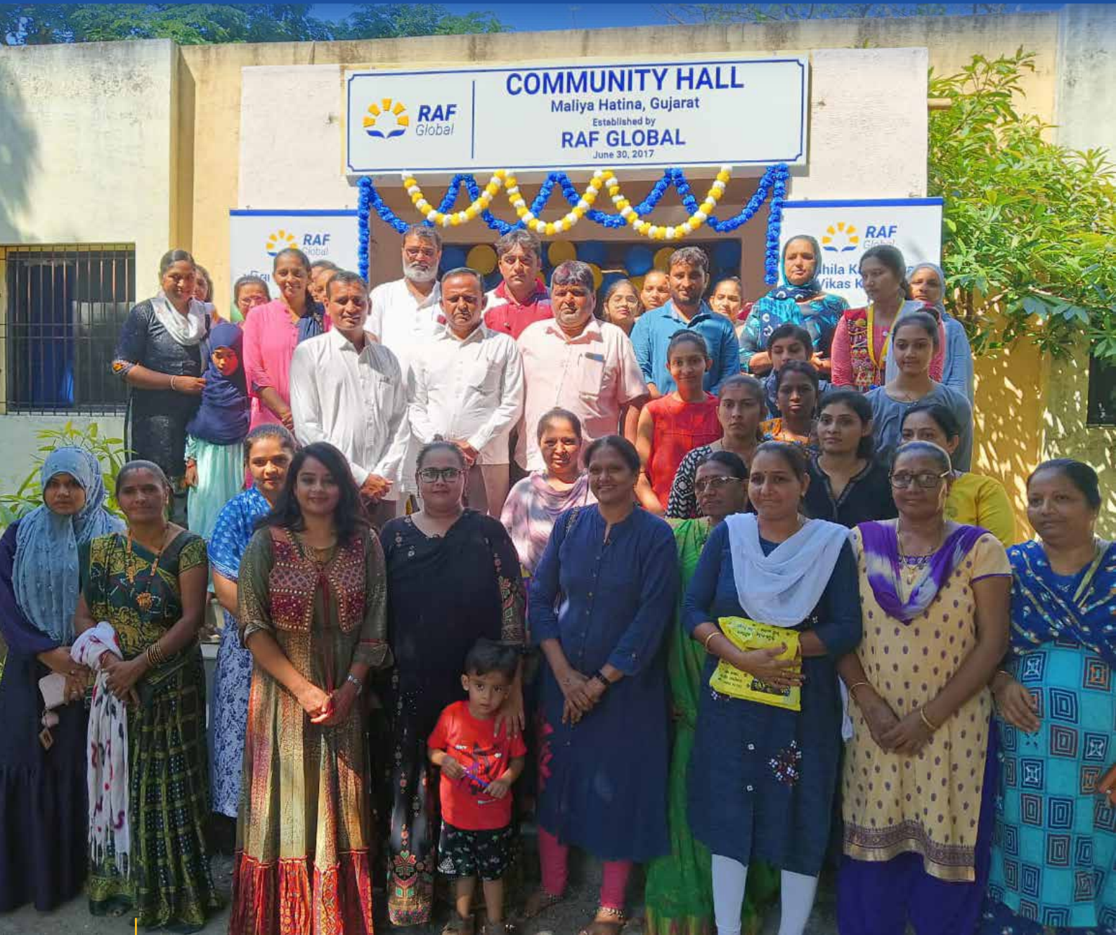
Inauguration of Mahila Kaushalya Kendra, Junagadh