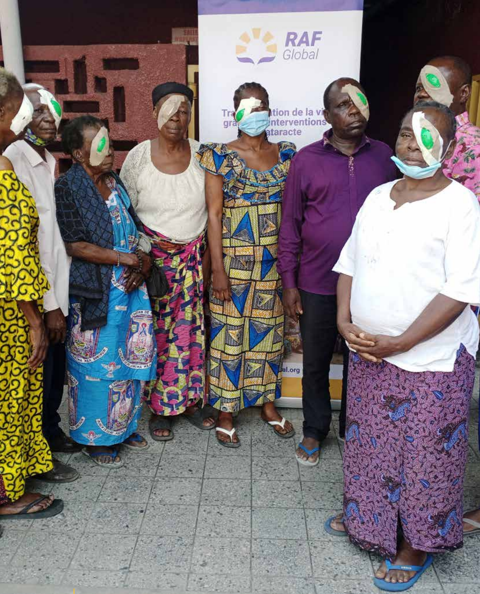
Elderly cataract patients, after the surgery facilitated by RAF Global through specific hospitals