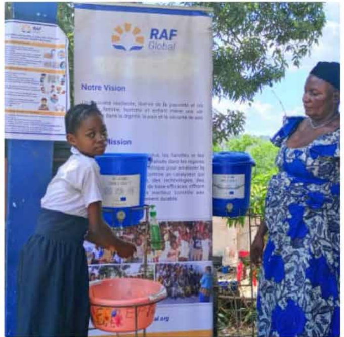
A montage of sessions on handwashing practices undertaken across schools, to observe Global Handwashing month in October