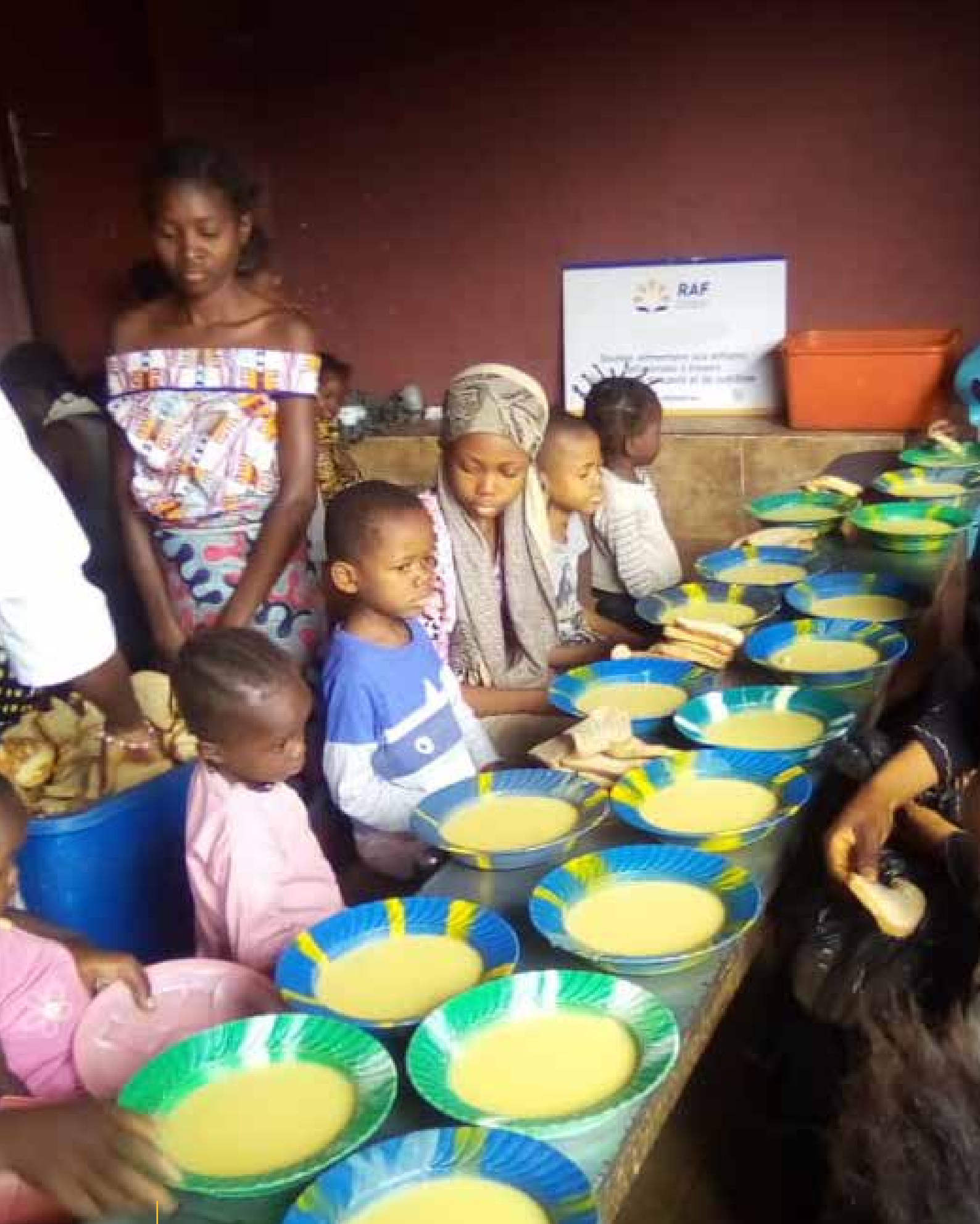
Children and caregivers eating a nutritious meal at the Center of Nutritionnel Soeur Veronique Natal, Mpsa (Nsele commune)