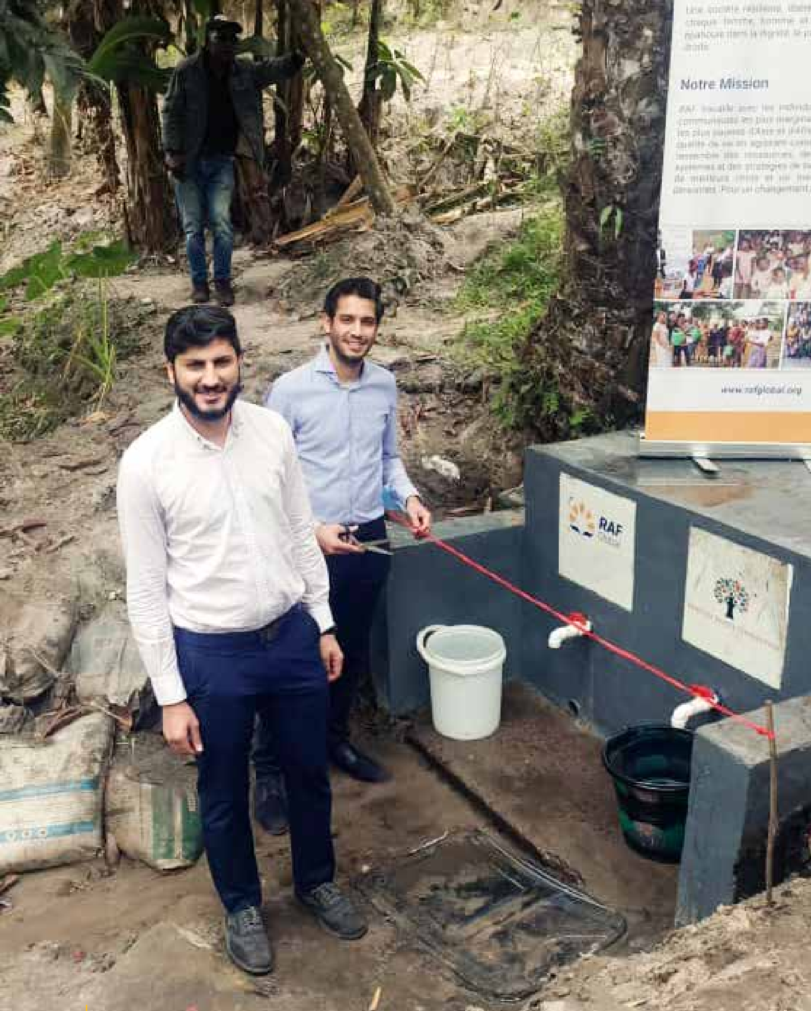
Esteemed donors inaugurate a water tank in an underserved locality.