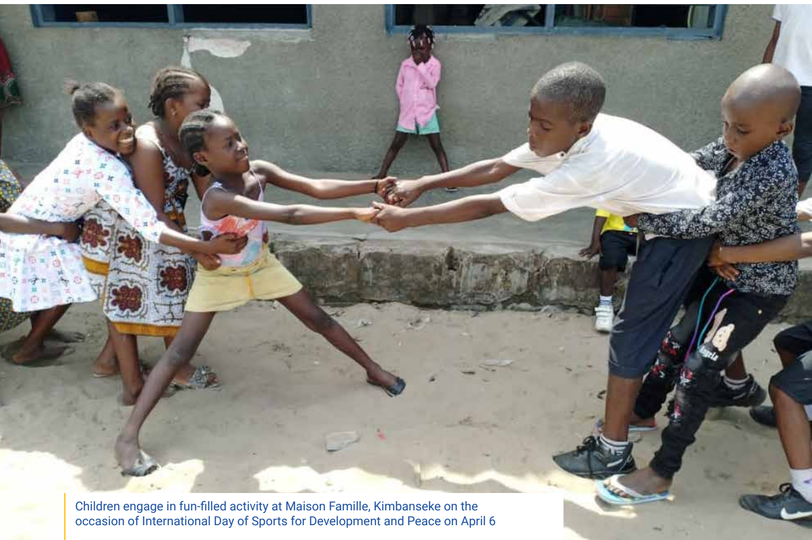
Children engage in fun-filled activity at Maison Famille, Kimbanseke on the occasion of International Day of Sports for Development and Peace on April 6