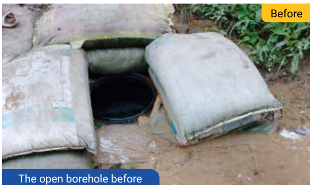
The open borehole before