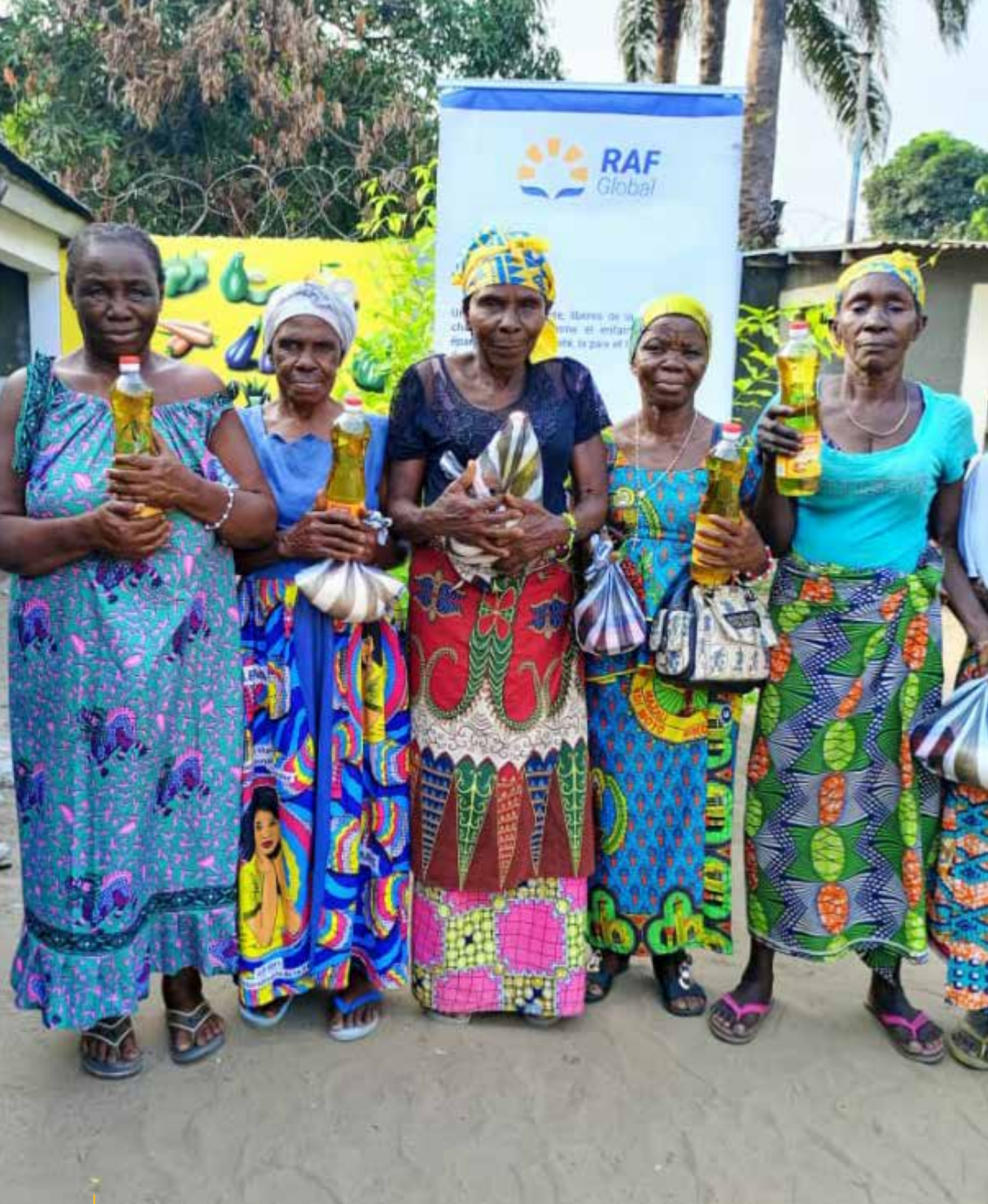
Elderly recipients of food baskets in Nsele commune, during the observance of International Day of Older Persons on October 1