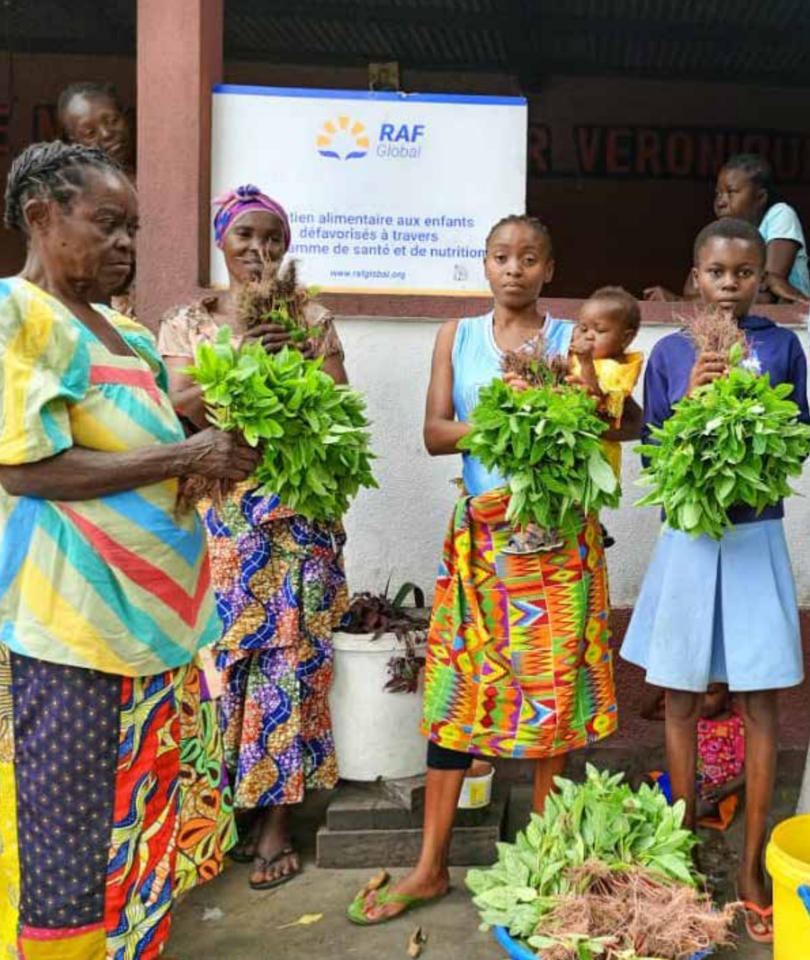
Trained in horticulture, 3 women farmers (and a girl) standing in the compound of 'Nutrition Centre' in Nsele commune and proudly displaying their first produce.

The women farmers use the produce for their families, and sometime for sale in local market. The Nutrition Centre also sources from them once a week, to prepare meals for undernourished children