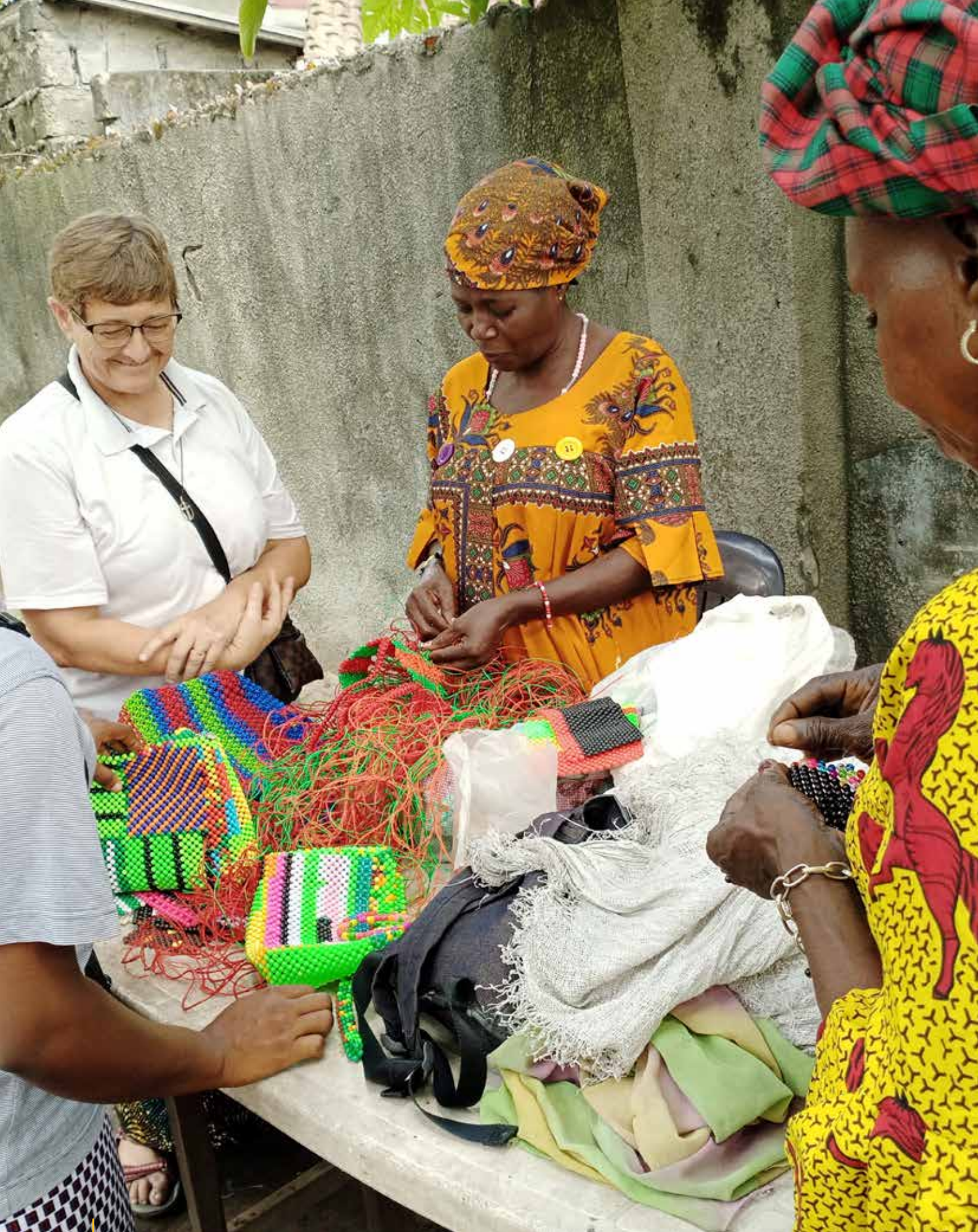
Women trained at RAF Global supported VTC proudly display their craft work, vibrant in colours and scoring high on usefulness