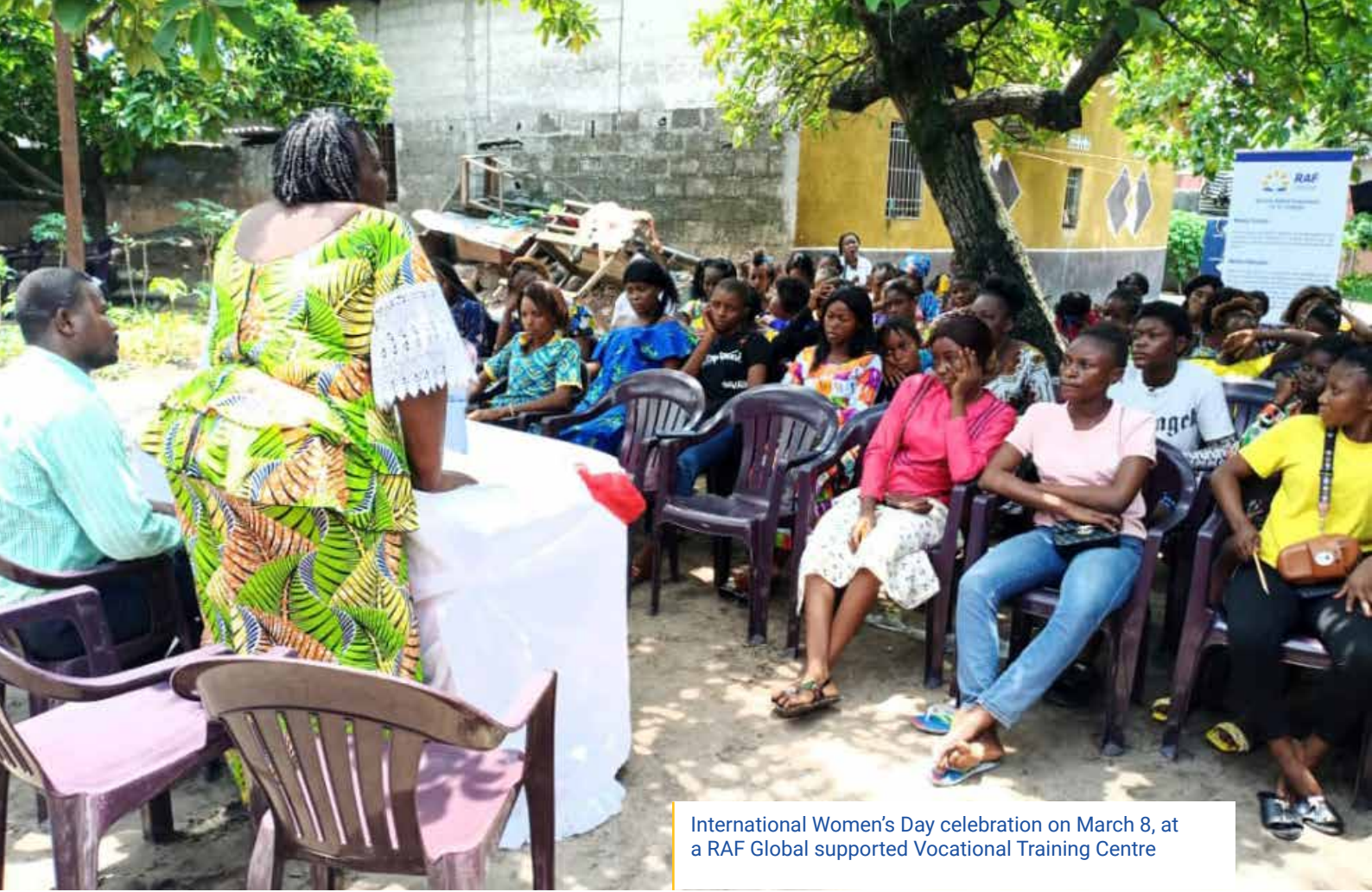
International Women's Day celebration on March 8, at a RAF Global supported Vocational Training Centre