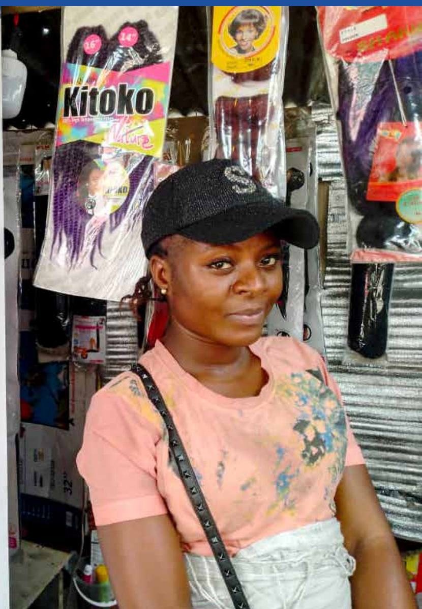
Musoki Chanel trained at RAF Global supported VTC and runs a shop in Mpasa, with the seed capital support