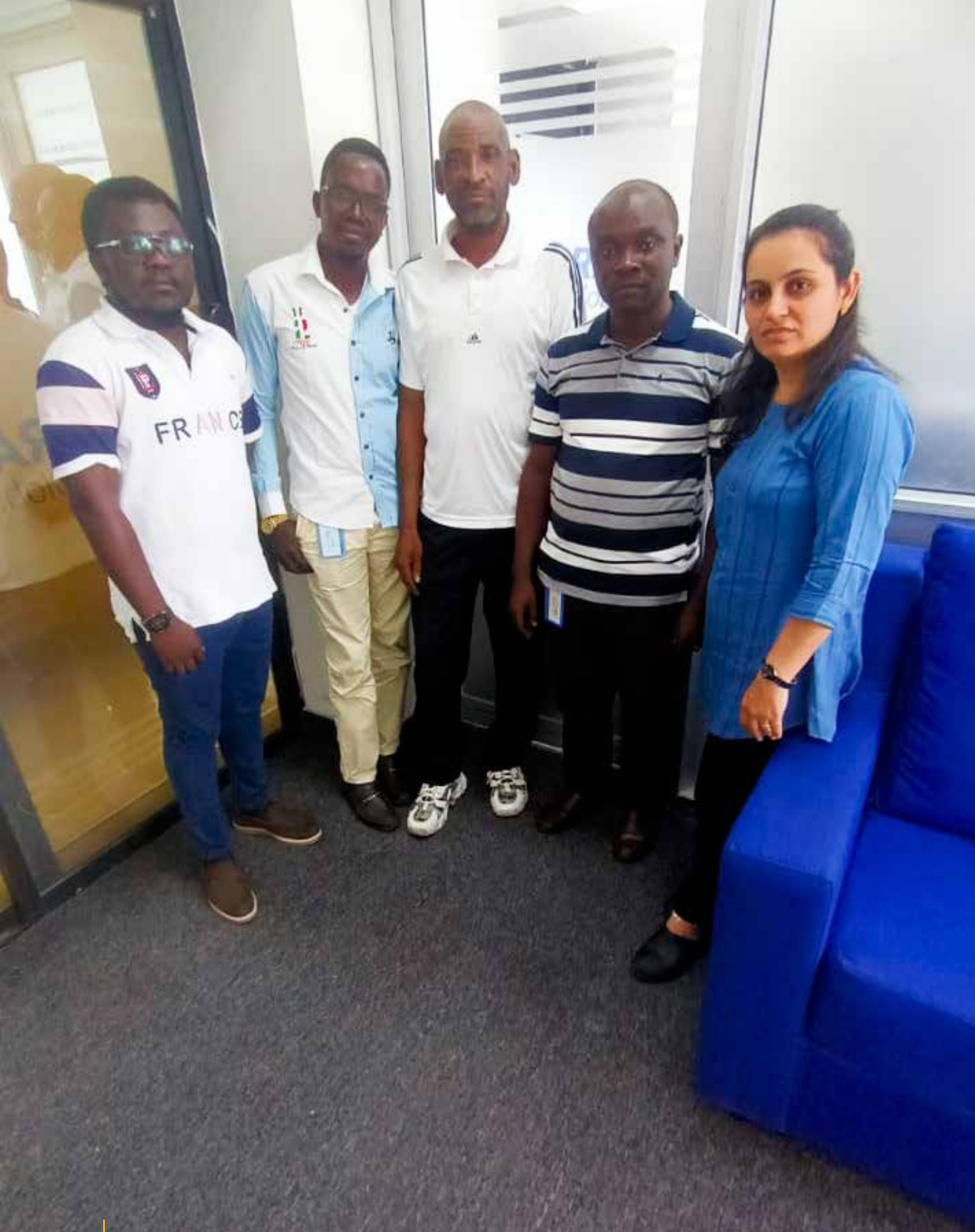
D.R. Congo Country Office team