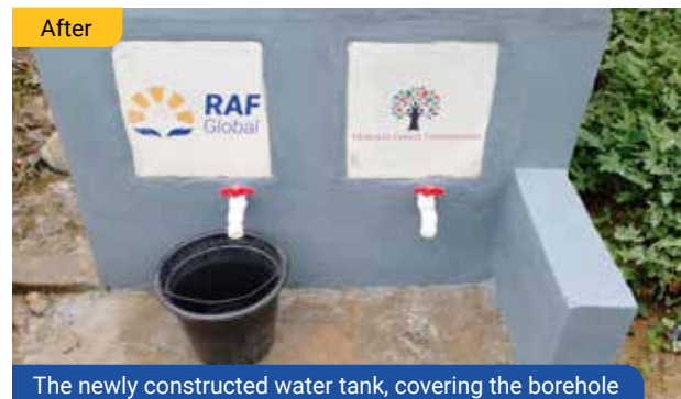
The newly constructed water tank, covering the borehole

I am Mboma Joseph and live in Efobanc quartier, Nsele commune. In our entire area, Avenue Mikonga 1, there used to be one open borehole to meet the needs of an entire community of 3000 residents. There were other challenges too. During rainy season, fetching water from this source was difficult. The water would get contaminated and used polythene, mud and other contaminants would flow into the water. Still, we had to rely on this water source and often, fell sick. The newly constructed water tank is well covered, and now accessing clean water anytime, is possible. The water source is now well protected. Water is also available free of cost. If possible, strong shed for the water table could be made, for protection against heavy rains. I thank RAF Global for constructing this water tank in our area. (Testimonial of a beneficiary in Nsele commune, taken during October-December 2022)